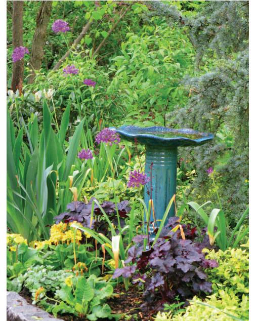
Spring Blooms of Purple Allium and Primrose among Heuchera 'Obsidian', Spruce and Iris.

and Candytuft just seem to herald the season. Now is the time to plan for additional plantings.